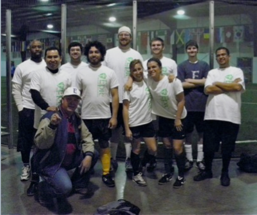
2011 EPIC Indoor Soccer team